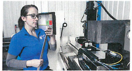
Laser Tube Cutting